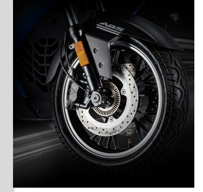
Dual ABS Disc Brakes