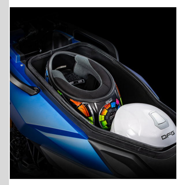
Large Storage Space