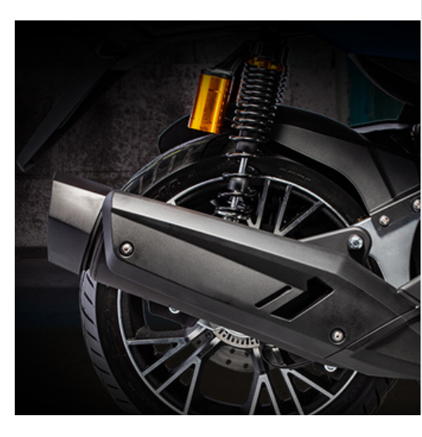
Gas Shock Absorber