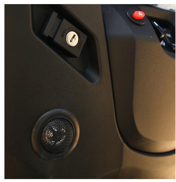
Dual Locking Dash pockets+Bluetooth 4-speaker system