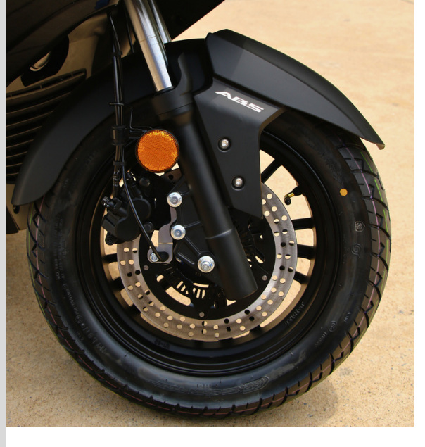
Dual ABS Disc Brakes