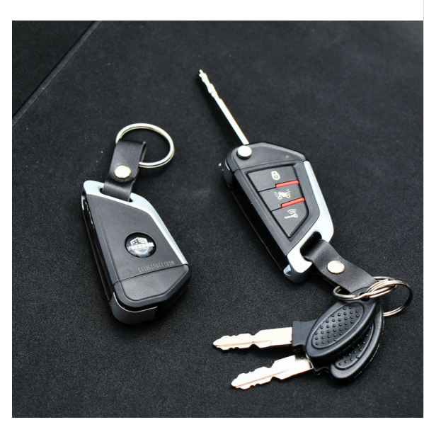
Keyless Fob & Start